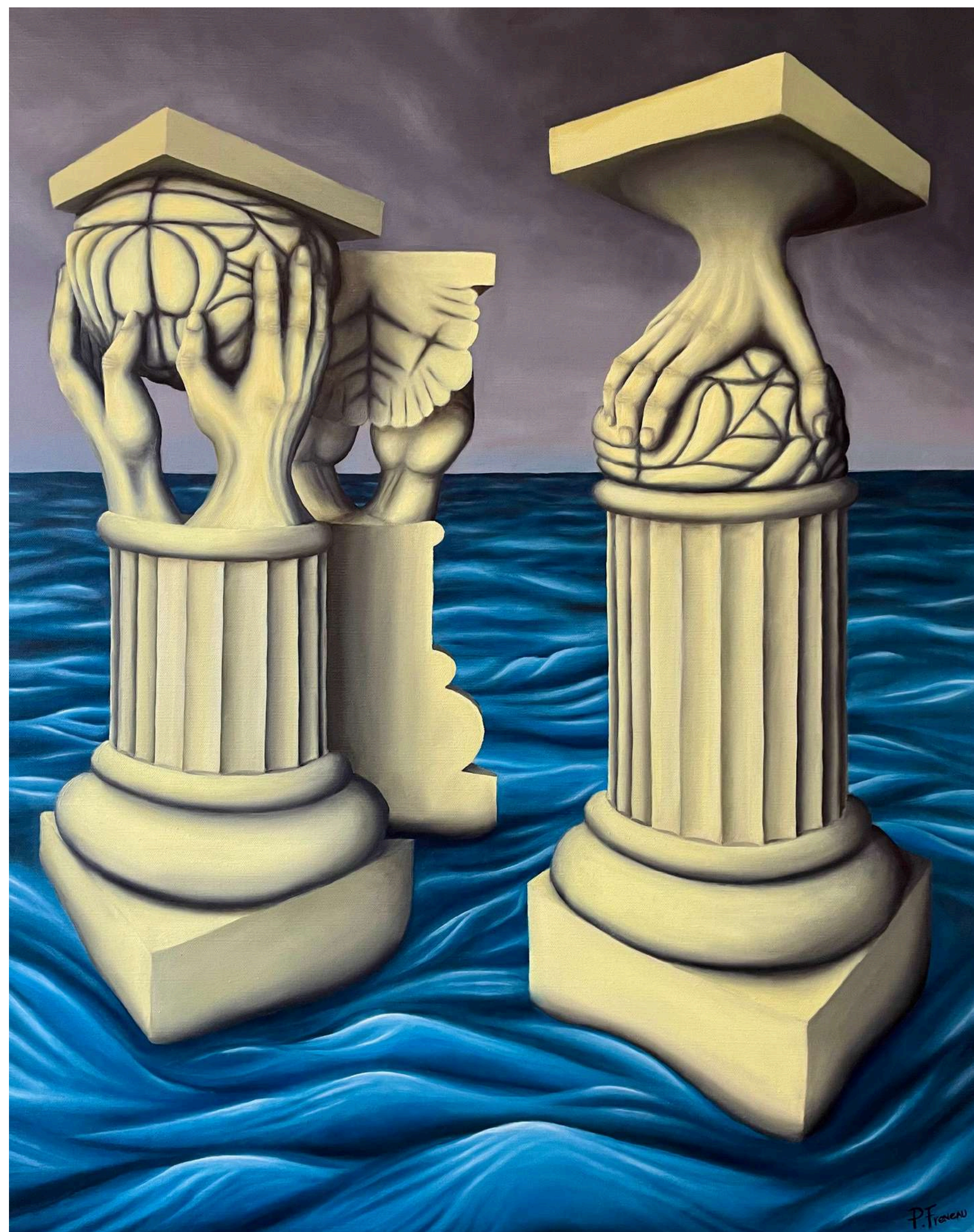
La naissance des passions